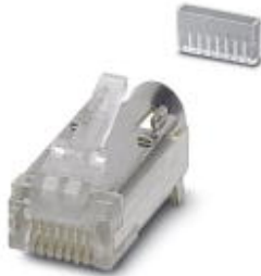
RJ45 pin insert, CAT5e, 8-pos., shielded, IDC connection method, for litz wires AWG 27 ... 26, with strain relief

Please be informed that the data shown in this PDF Document is generated from our Online Catalog. Please find the complete data in the user's documentation. Our General Terms of Use for Downloads are valid ( http://download.phoenixcontact.com )